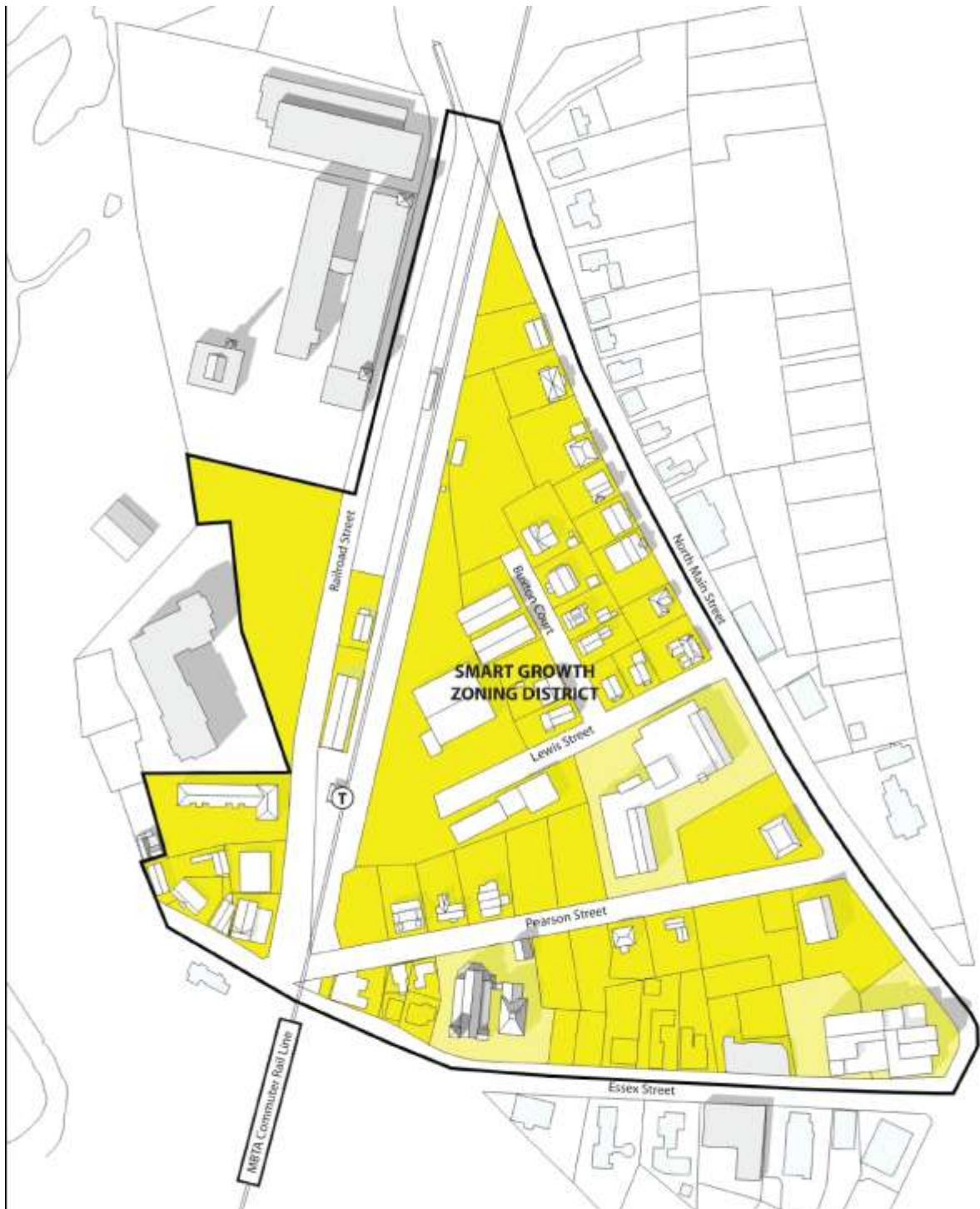
Figure 6: District Boundary December 31, 2009