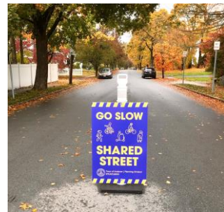
Figure 2: Maple Avenue Traffic Calming Pilot

Temporary traffic calming measures have been shown to improve safety for all roadway users and resident quality of life. These measures can help to reduce the number of fatalities resulting from roadway crashes, especially those involving pedestrians and cyclists, discourage heavy vehicles and through traffic from using certain routes, reduce speeding, improve the street environment, and provide a greater feeling of safety. The Plan will also complement the Active Transportation Plan which is currently in development. The first temporary traffic calming project was deployed on Maple Avenue in the Fall of 2022 and Spring and Summer of 2023 using moveable bollards. Traffic data collected by The Andover Police Department showed lower top speeds and decreased traffic volumes on this residential street commonly used as a cut through for motorists. Post deployment survey data showed an overall favorable resident response to the project. During the project, numerous requests for traffic calming on surrounding downtown residential streets were submitted.