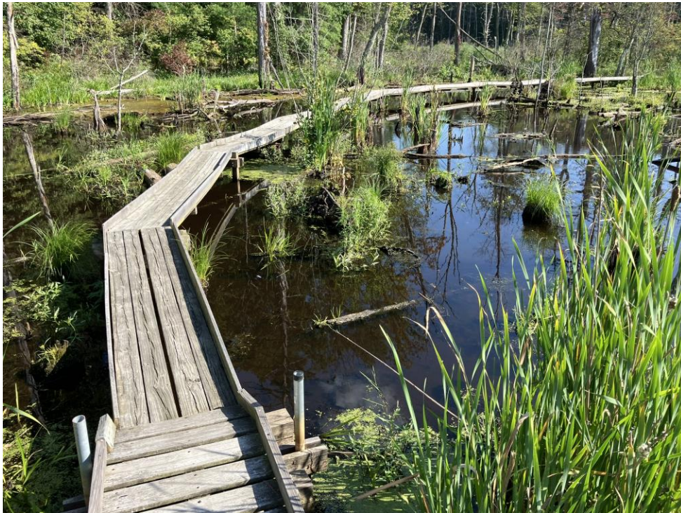
End section of boardwalk where the decking is beginning to warp and buckle due to water damage and use. During the wet season, the water comes within three inches of overtopping the boardwalk.