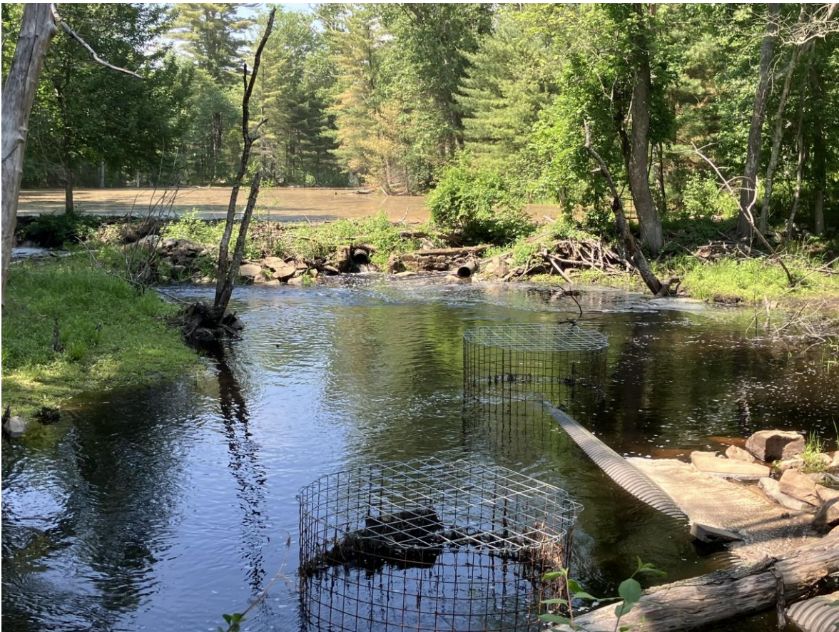
Beaver Deceiver flow-through devices installed on the Skug River in Andover Conservation's Jenkins Quarry Reservation. Note the circular metal cages, HDPE pipe, and series of two beaver ponds separated by a large beaver dam in the background. Photo taken in June 2024.

In the past, the Town of Andover – through the Department of Public Works – have contracted with Beaver Solutions, Inc. for their professional assistance to help resolve beaver-related issues. Beaver Solutions have installed and maintained flow through devices – their term is Beaver Deceiver - on sizeable beaver dams at three locations in Andover-on-Andover Conservation land. These locations include off Douglass Lane (Jenkins Quarry Reservation), adjacent to Gray Road, and just south of River Road at the River Road/Chandler Road intersection.