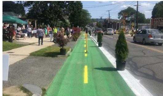
Figure 4: Pittsfield, MA