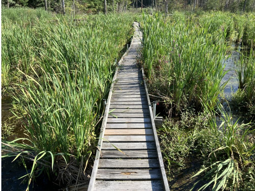
Replaced and damaged decking on the four-foot-wide boardwalk