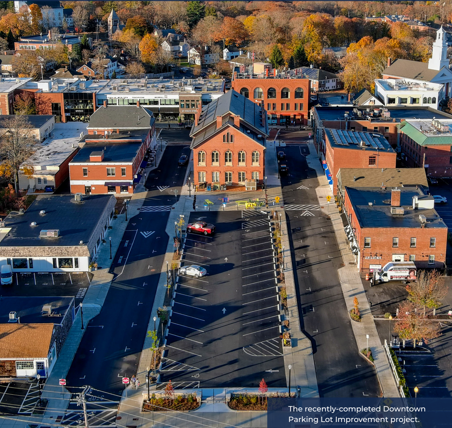
The recently-completed Downtown Parking Lot Improvement project.