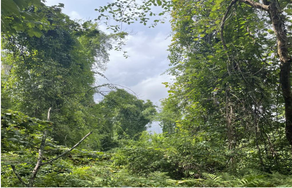
Jillian Way at AVIS's Deer Jump Reservation before treatment.