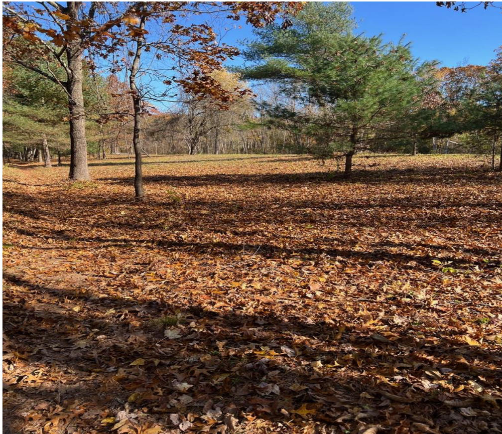
Jillian Way at AVIS's Deer Jump Reservation after treatment.