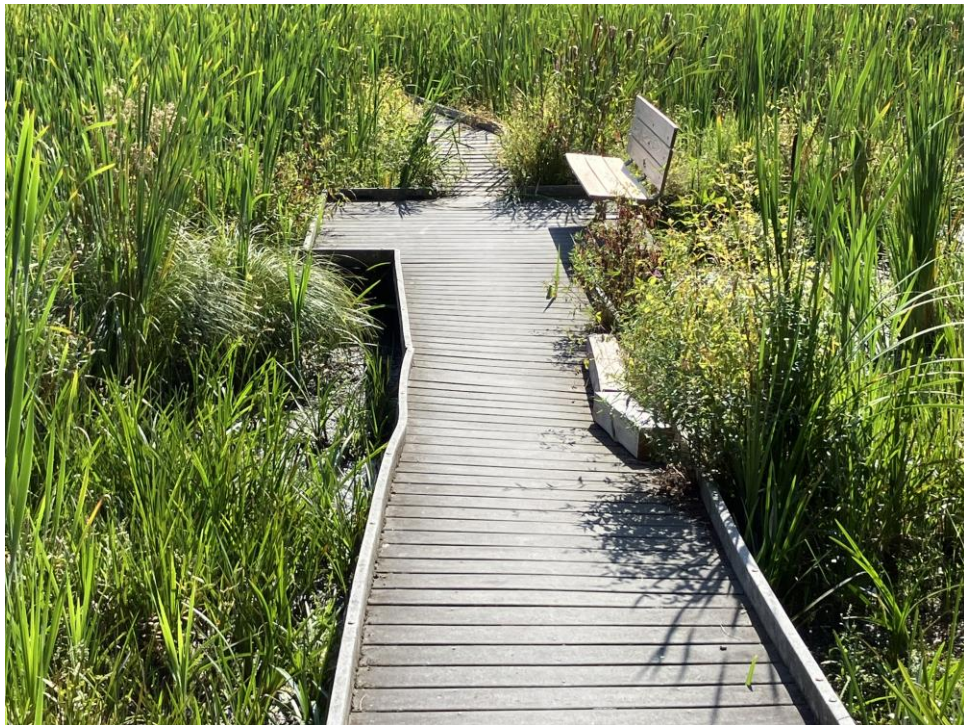
Mary French boardwalk, right side sinking into the marsh.