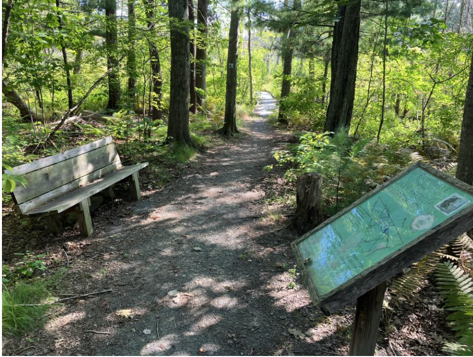
Mary French Reservation trail head