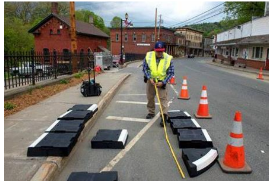
Figure 3: Bethel, NH