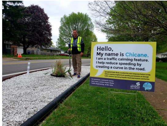
Figure 2: Springfield, MO