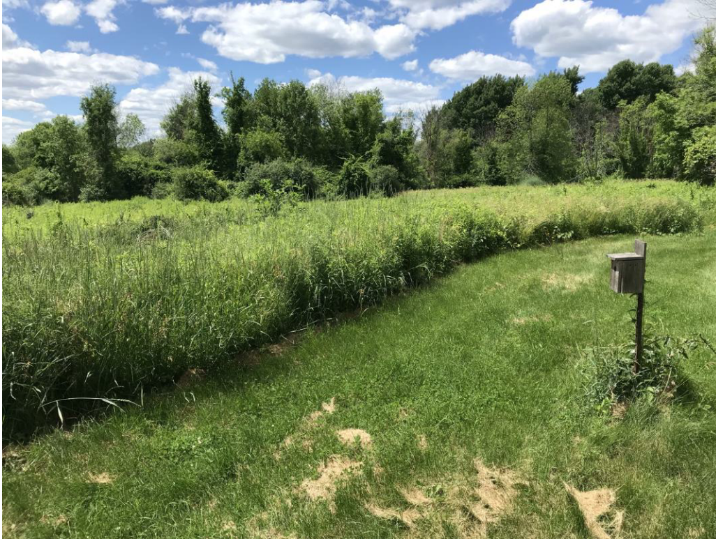
The Meadow at Retelle Reservation.